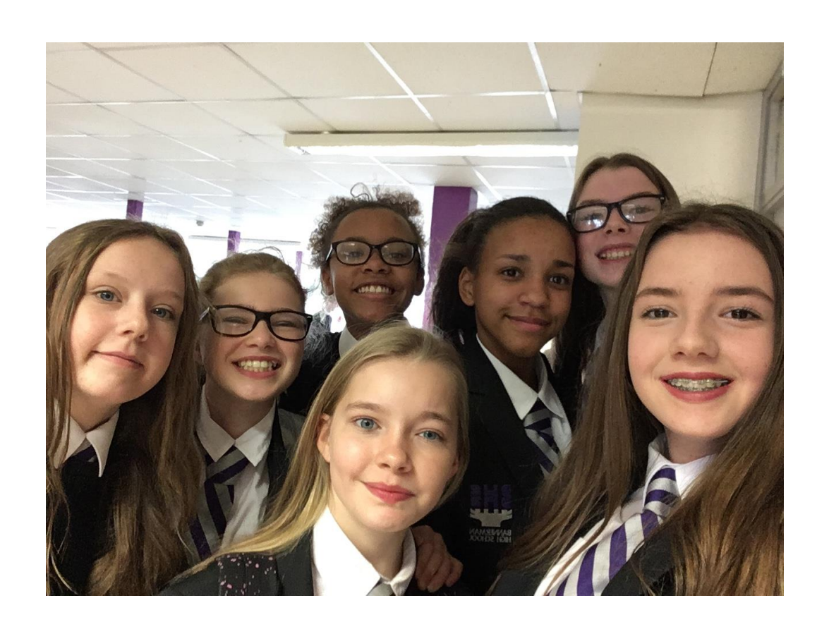
Welcome to Bannerman High School

I would like to welcome you and your child to Bannerman High School.